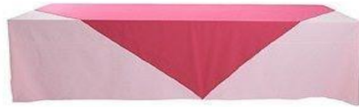
8' x 30" Table with 156" x 90" Underlay and 90" Square Overlay (Diamond)