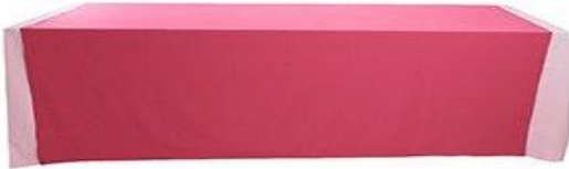
8' x 30" Table with 156" x 90" Underlay and 90" Square Overlay (Cap)