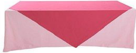
6' x 30" Table with 132" x 90" Underlay and 72" Square Overlay (Diamond)