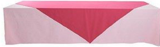
8' x 30" Table with 156" x 90" Underlay and 90" Square Overlay (Diamond)