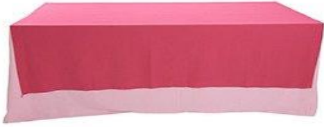
6' x 30" Table with 132" x 90" Underlay and 72" Square Overlay (Cap)